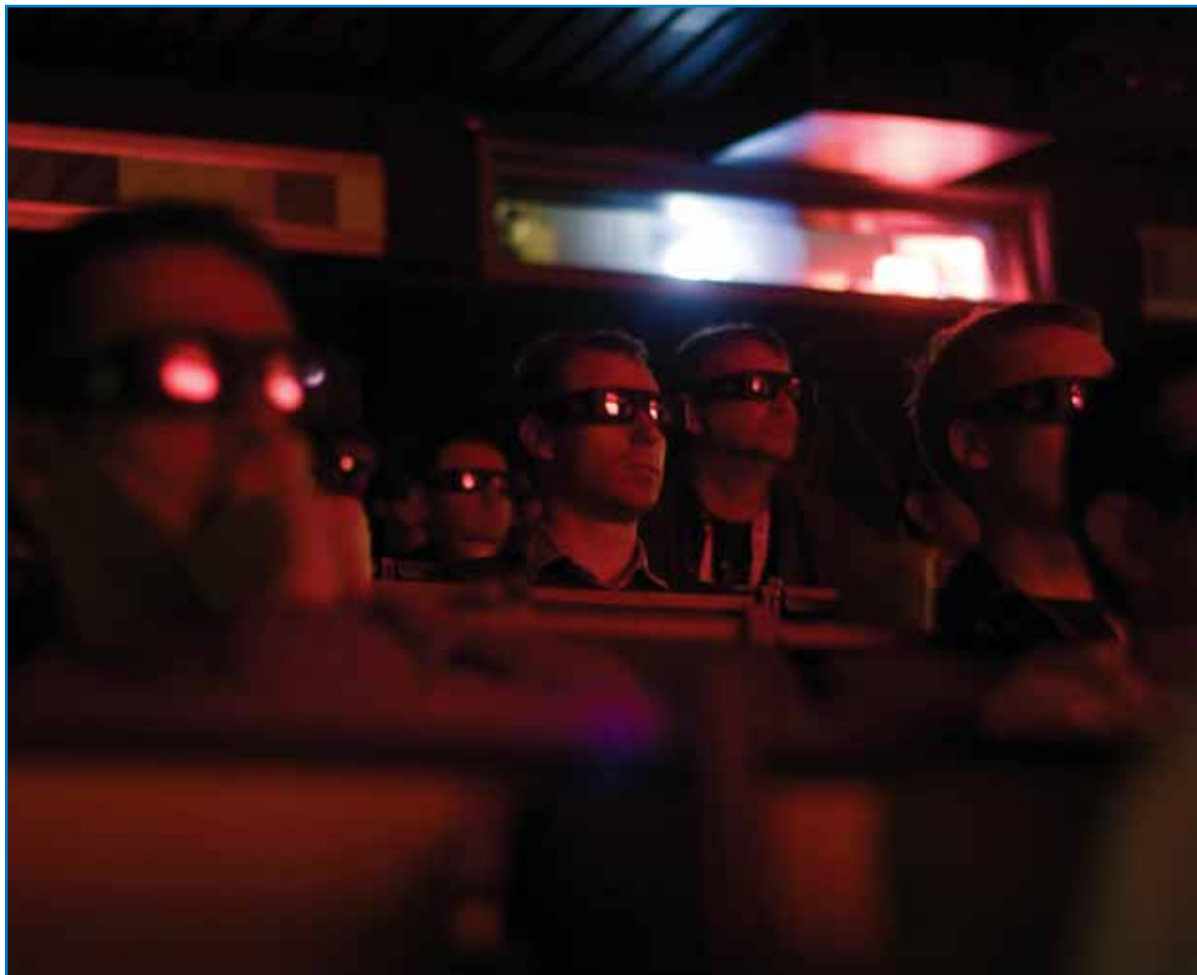
An audience uses 3-D glasses to watch a three-dimensional video projection.

"Projectors are a 10-year minimum investment," he said. "But if someone came to my district and said, 'I will sell you 3-D ready projectors for only $25 more than a regular projector,' I'd have to seriously consider it—because being 3-D ready is worth it."