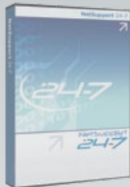
On Demand Remote Support