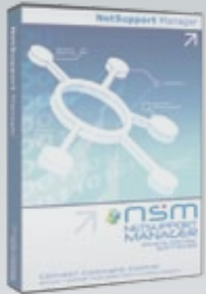
PC Remote Control